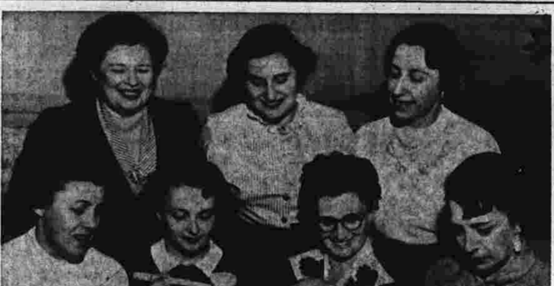
Shown above is a group of the workers on ceramics for the combined bazaar of the Sisterhood and Hadassah Chapter of Hadassah, scheduled for Sunday, May 16, from 2 p. m. to 8 p. m. at Temple Beth Shalom, 63 Linden St.